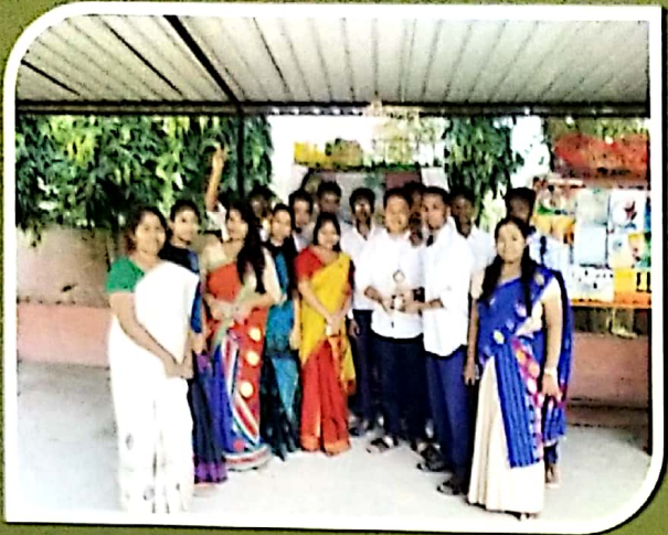
Third prize in wall magazine competition