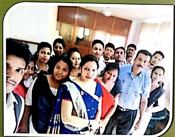
Bca 6 th semester farewell