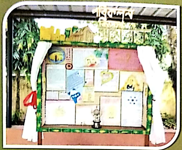
Wall magazine 2019