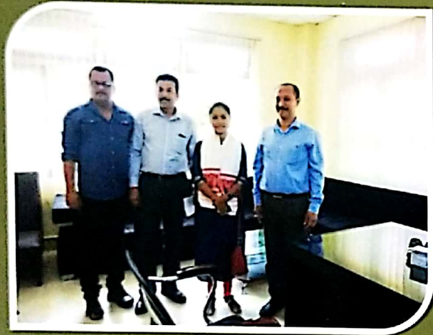
PGDCA 1 st rank holder under DU