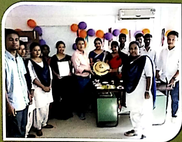
Teacher's Day celebration