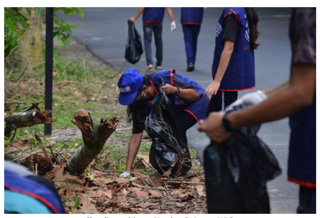
Cleanliness drive at Nambor Doigrung WLS